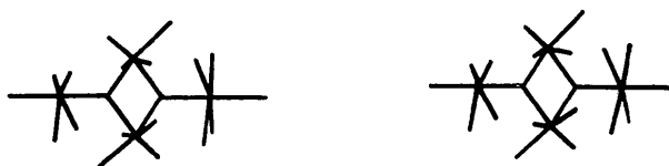
Fig. 2. Stereoscopic view of the molecule.